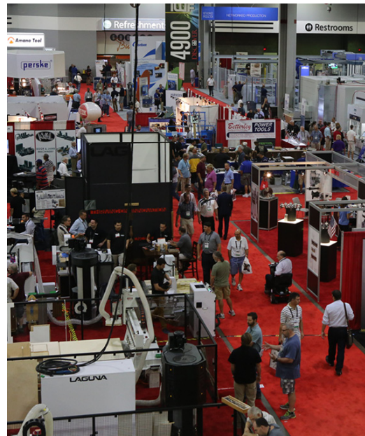
Air Handling Systems - Booth 5900