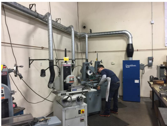
Close up of new dust collection hooding.

Connecticut based leader in progressive stamping and precision metal components, our customer had a need to improve dust collection on this sanding line.