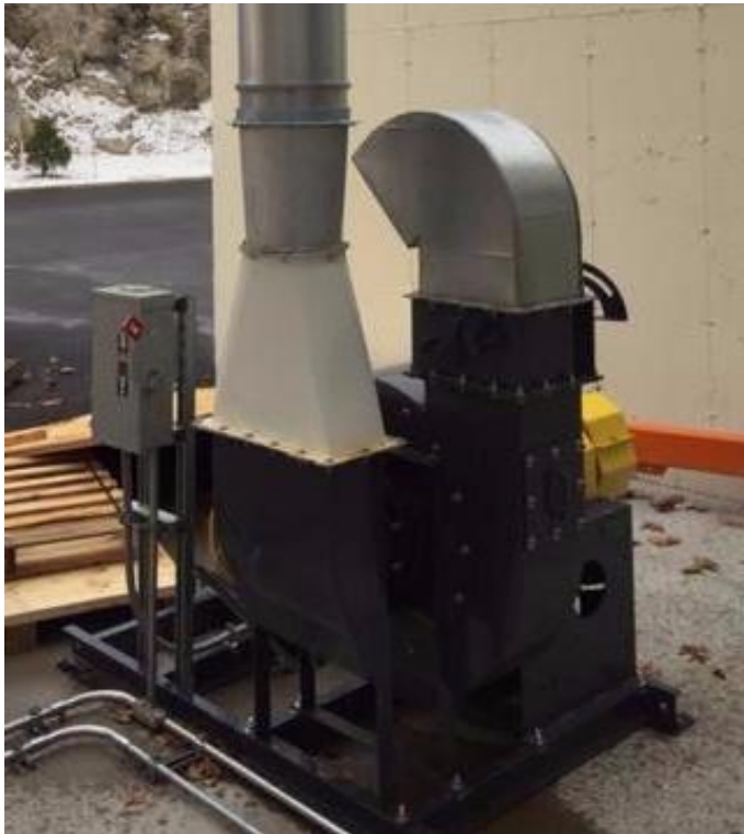
Before - Sound improvement