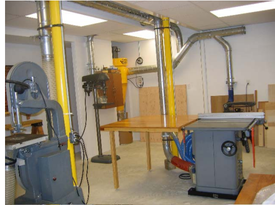
Hobby Shop Ductwork

For many years, Do It Yourself woodworkers have inquired about the use of our piping. Cost constraints were a major obstacle in the use of industrial pipe for a small shop. For this reason, Air Handling Systems has developed a complete line of DIY Ductwork. We have maintained all proper design characteristics of the industrial piping.