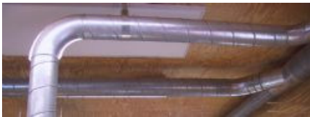
Light Gauge 5' Spiral Pipe

Manufacturing in lighter gauges of galvanized metal has considerably cut the cost. The DIY ductwork will withstand the vacuum level of up to a 3 horsepower dust collector. Size spectrum is 3" - 7" diameter. We look forward to helping you achieve a dust free wood shop as we have done with thousands of industrial wood working factories.